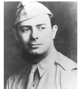
Rabbi Alexander D. Goode